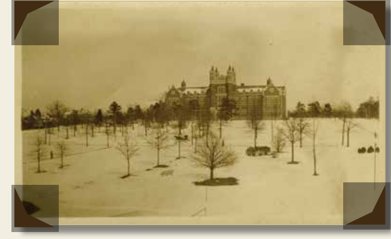
WINTHROP TRAINING SCHOOL during the great snow of 1912.

degrees.lowest temperature of 11 degrees. The Charleston Airport's mild 70Society Hill ties their 1931 record warmest Thanksgiving on the<br/>fourth Thursday, November 22, 1934, with 83 degrees and a daylowest temperature of 11 degrees. The Charleston Airport's mild 70degrees on the Friday after Thanksgiving, November 24, plunged<br/>55 degrees overnight to a Saturday morning 15 degrees, their all-